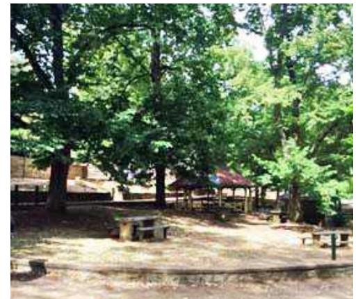
Vaughan Springs Picnic Area

Turn left (south) on the GDT and walk for 1.4 km to reach the Tubal Cain mining complex (GR 529810) on the right, and a dam on the left. Walk another 100 m and take the right track, which is the water race along Sailors Gully. The GDT meets Helge Track after 700 m. Turn right (west) onto Helge Track and retrace your steps to the start of the walk.