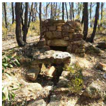
Tubal Cain Horizontal Chimney

Continue north-east along the ridge to the water race along the Loddon River (GR 540832). Walk a further 20 m