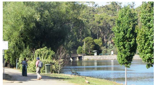
Lake Daylesford Weir

Start the walk at Lake Daylesford car park walking on the track on the south side of the lake with the lake on the right. Pass rows of concrete seats on the left and descend by the dam wall following the track to Central Springs. With Wombat Creek on the left follow the track via Sutton Spring to the Midland Highway. Carefully cross the highway to Twin Bridges picnic area and the junction of Wombat Creek with Sailors Creek. Cross the bridge to the west side of Sailors Creek and follow the track north. After 500 m, at an unmarked track junction keep left and do not go down the spur and cross the creek. Follow the track along the hillside to Tipperary Springs on the right (GR 449638). This is a good spot for morning tea. The spa water here is reputed to be the best in Daylesford. Returning to the west of the creek continue north on the track 3.3 km to Bryces Flat (GR 448659). This is a good spot for lunch. There is an abundance of evidence of gold diggings along here. After lunch cross the creek to the east bank and turn south (right) on the track to return to Tipperary Springs on the opposite side of the creek. From Tipperary Springs walk a short way up the sealed road and turn right onto the track which is indicated by a sign. Remaining on the east side of the creek continue on the track to Twin Bridges. Retrace the same track after crossing the Midland Highway to return to Lake Daylesford and the start of the walk.