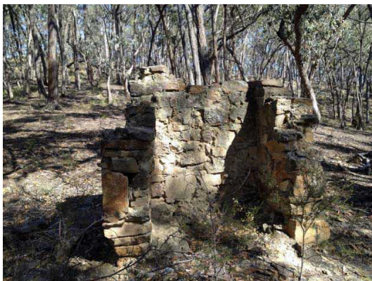
Mr Hunts Chimney

Remain on the GDT for 1 km travelling north-west then west until meeting a vehicle track on the left at GR 532782. Follow this track for 350 m south-west to GR 530779 and then off-track south to Mr Hunts Chimney and mine shafts at GR 531778. Leave Mr Hunts Chimney and travel west for 250 m to meet the Loop Track at GR 528778. Turn right (north) onto Loop Track and after 300 metres intersect with Wewak Track at GR 527781.