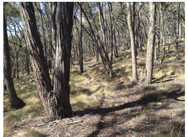
Open Forest on the Great Dividing Trail

The walk starts at the intersection of Wewak Track and Porcupine Ridge Road (Grid Reference (GR) 519787). Walk south-east on Wewak Track for 670 m then turn left and leave Wewak Track at GR 524782 to go off-track. Follow Sebastopol Creek south-west upstream for 1.3 km until meeting Porcupine Ridge Road at GR 518772 Turn left to follow this road for 1.2 km to join the GDT (GR 521761). Follow the GDT, travelling north-east, for 1.2 km to intersect Loop Track at GR 527768 and continue a further 1.9 km to Browns Gully at GR 538777.