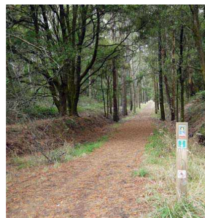
Domino Rail Trail

Start the walk at the cars parked opposite the Radio Springs Hotel, Lyonville (Grid Reference (GR) 575583). Walk 20 m from the hotel to the information board in Main Street. Follow the track, which starts directly behind the information board, across the Coliban River flats and continue until it crosses the Domino Trail approx 60 metres from the start. The track is just to the south of the Domino Trail and roughly parallel to it. After a further 400 m, and just after crossing a creek, the track turns left (north) at GR 584582 and crosses the disused railway line, i.e. the Domino Rail Trail. Continue on a vehicle track which swings north-east for about 500 m to a track junction (GR 585586). Turn right (east) and continue on this track for about 3.5 km to join the Domino Rail Trail at GR 620588. Proceed along the Rail Trail for about 1 km to Trentham Station (GR 631589). From there, walk around to the Trentham Park and Lake for lunch. After lunch head back to the Domino Rail Trail and follow the long, straight length of it back to Lyonville and the start of the walk.