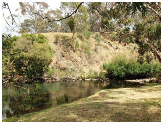
Clarkes Pool on Jim Crow Creek

care and walk 500 m to Carrolls Lane at GR 461721. Follow this gravel road (west) for 2 km to the junction with Hepburn-Newstead Road at GR 440722. Turn right and walk along the side of the bitumen road for 2.5 km to the junction with South Street at GR 438746. Turn left along South Street at the Franklinford sign, passing the Aboriginal school site, to Clarkes Road. Turn right for about 50 m then left to take a short side trip to both the Franklinford Spring and Cemetery before returning to Clarkes Road. Turn right and continue for about 800 m south-west to the end of Clarkes Road at Clarkes Pool on Jim Crow Creek (GR 429741). This is the end of the walk. Execute the car shuffle to return the walkers back to base.