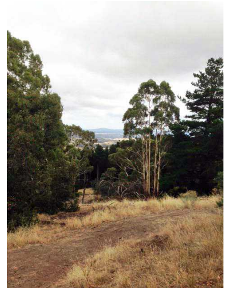
View north from Mt Franklin

This Walk Sheet describes a bushwalk, part of Bushwalking Victoria's Federation Walks 2015 program in the Daylesford and Hepburn Springs area on 24-25 October 2015. The host clubs for this event are Bayside Bushwalking Club and The Great Dividing Trail Association. Bushwalking Victoria, the host clubs, their members and walk leaders cannot accept any responsibility for errors, omissions or changes to the circumstances on which this information is based, nor can they accept responsibility for any loss or injury sustained by any person using this Walk Sheet.