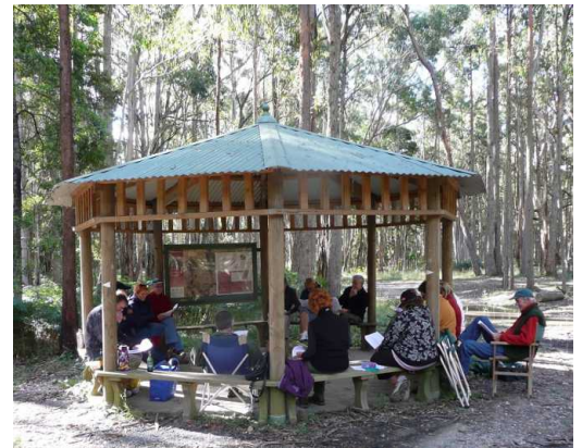
Wombat Station Rotunda

From the start at the Wombat Station rotunda (Grid Reference (GR) 415530) walk north-west on an elevated easement for 470 m. Turn right (north) onto a maintenance road for 420 m to a T junction and turn left to follow the boundary of Yoga Ashram. Continue north on a minor road beside a blue gum plantation. Follow the loop in the track, first east then south, then east again to a track junction at GR 415540. Turn right and walk for 130 m to another T junction. Turn left (north east) and, ignoring a track to the left after 300 m, continue for 1 km to a track on the right. Continue north-east and take a right-hand fork. Follow this footpad through to White Point Track at GR 426551. Turn right and walk along the road for 400 m to a GDT marker post at GR 430549. Turn left and follow the GDT into the bush to the site of the White Point Diggings (GR 434550), which can be seen in a gully 600 m from White Point Track. Continue a further 700 m to Sailors Creek Road, initially following the course of the headwaters of Sailors Creek.