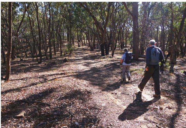
Typical track through open forest

Turn left and follow the track south-east and then south for 1.6 km keeping a watchful eye for open mine shafts until joining Basalt Gully Road (GR 429687). Follow the gravel road for 600 m then make a left turn along Boots Gully track with its steady climb for 1.2 km in a southerly direction. Turn east-north-east along Blowhole Track for 200 m before turning east-south-east (GR 433673) along a poorly defined track which after 200 m becomes more clearly defined. Continue a further 800 m to a track junction visited earlier in the walk (GR 439671). Turn right along the track heading south-east and follow the remains of a former water race, which meanders along a contour in a south-easterly direction. Turn in a north-north-easterly direction to the Blowhole viewing site and then return to the car park.